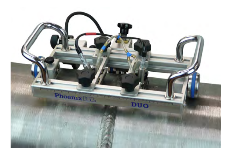
Standard Duo scanner with wheels