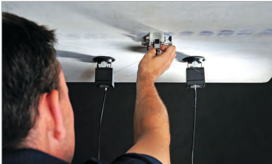
Tracer - Inverted scan inspection

Tracer is a versatile freehand scanning system that calculates and outputs accurate X-Y positional data for C-scan inspections without the constraints of a scanning frame. Tracer is ideally suited to operate with linear array probes to provide a fast, simple and flexible portable C-scan inspection kit.