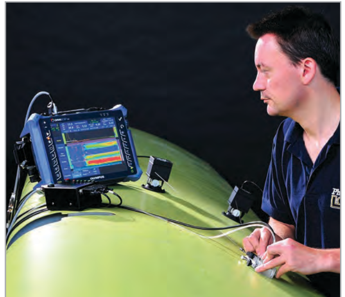
Typical scanning application