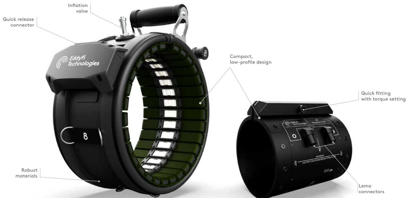
PIEZO TOOLING 6 - 72 inch

Sonyks is an incredibly versatile system that allows operators to address more applications thanks to short-range and medium-range capabilities in addition to long-range ultrasonic testing. For example, use the new 128 kHz magnetostrictive collar to inspect flanged pipes efficiently.