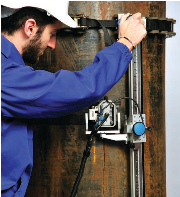
MapMan with additional belts