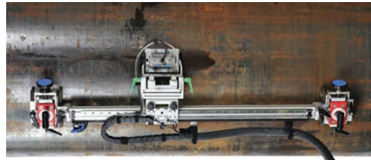
MapMan with optional brakes for use on tanks and vessels