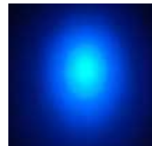
1 - LED Array at 15"